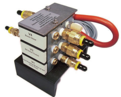
AIR LOCKOUT KITS