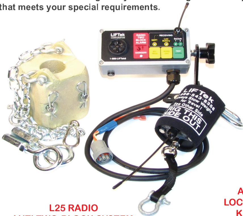
L25 RADIO ANTI TWO-BLOCK SYSTEM

We take pride in our proven track record of "on time" deliveries, quality products and exceptional service to both OEM and aftermarket clients worldwide. We provide free telephone support, same day shipping and same day repair service for our standard crane products. We look forward to working with you in selecting a standard product or in developing a system that meets your special requirements.